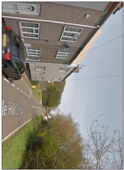
VIEW UP THROUGH BOLEHILL